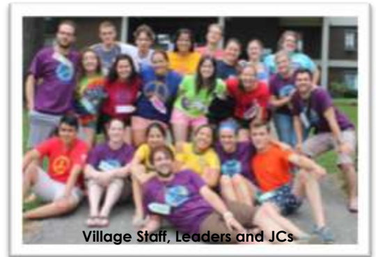
Village Staff, Leaders and JCs